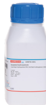
Butylated Hydroxy Anisoles (BHA)