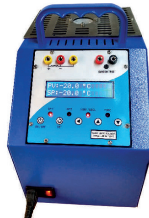
Negative Dry Block Temperature Calibrator