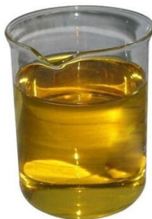
Creosote Oils (Light/Heavy)