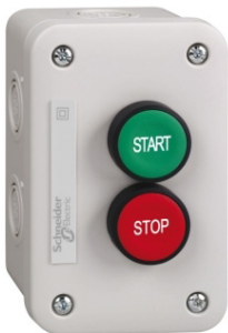
START/STOP PUSH BUTTON