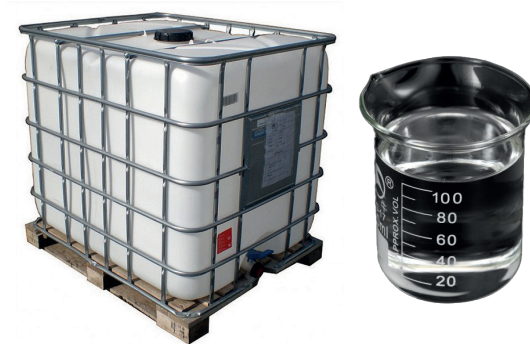
Monoethylene Glycols ( MEG )