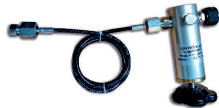
Low Pressure Screw Pump