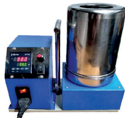
Wet Temperature Bath