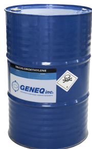
Tri Chloro Ethylenes