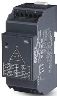
SINGLE PHASE PREVENTER